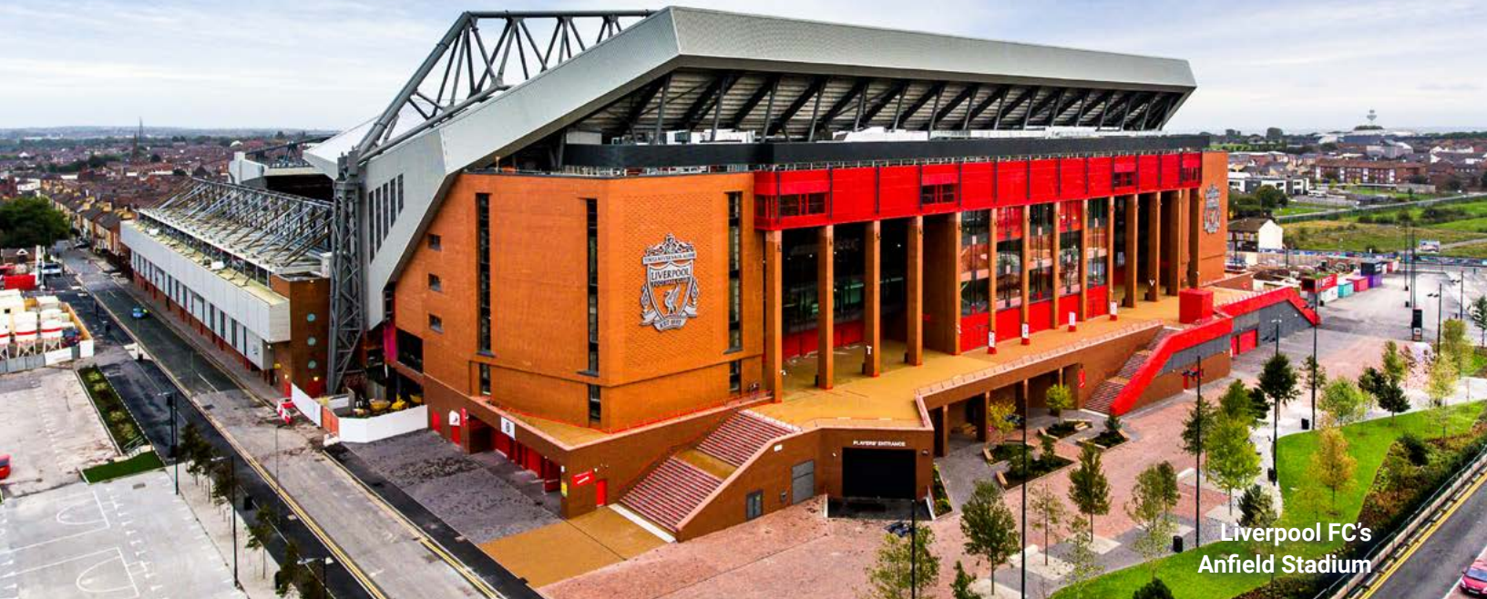
Liverpool FC's Anfield Stadium

September 6 - 7, 2021 • Liverpool FC's Anfield Stadium • Liverpool, UK