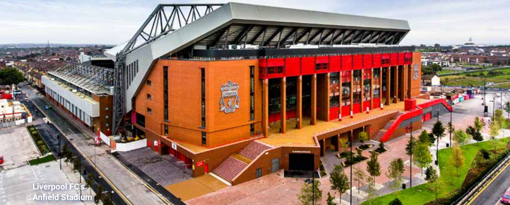
Liverpool FC's Anfield Stadium

October 12-13, 2020 • Liverpool FC's Anfield Stadium • Liverpool, UK