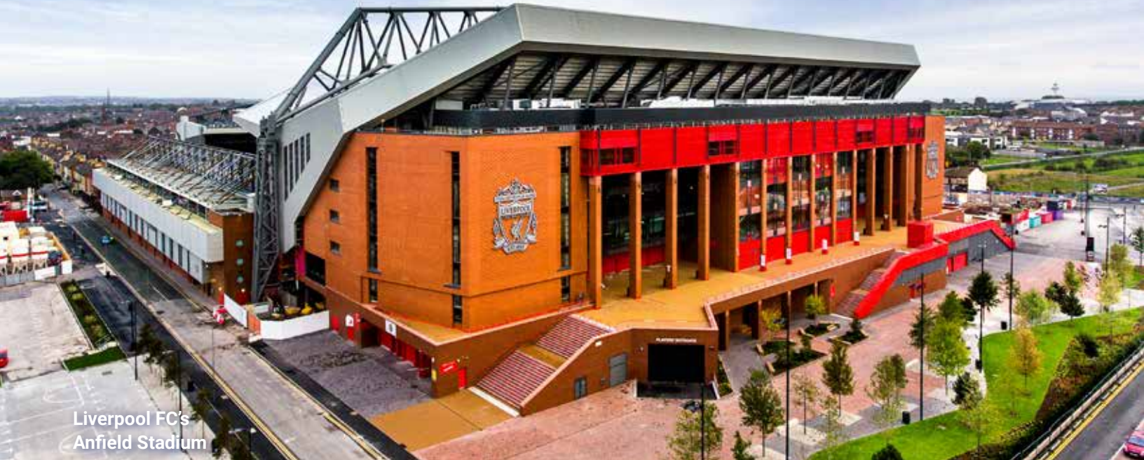
Liverpool FC's Anfield Stadium

March 15 -16, 2021 • Liverpool FC's Anfield Stadium • Liverpool, UK